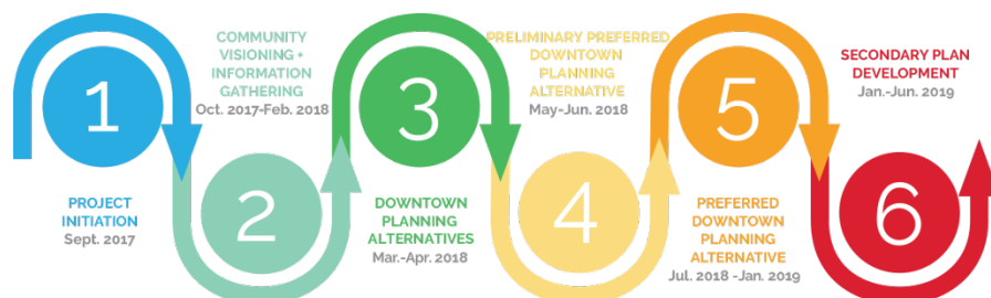
Figure 1: Six Phase Planning Process

The project is being undertaken through six phases as outlined on Figure 1.