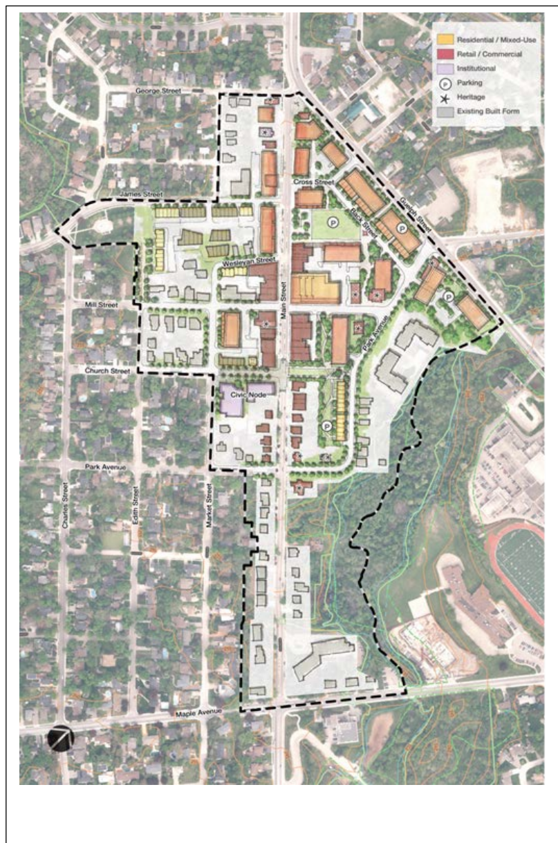
Figure 5: Preliminary Preferred Alternative (as presented on May 24, 2018)

As a result of the analysis, the consultant team assembled the best elements of each alternative based on the technical analysis, implementation of the Vision and Guiding Principles, and public consultation, and developed a Preliminary Preferred Alternative as shown on Figure 5. Slide 41 through to slide 48 on the presentation attached as Schedule C provide details on the Preliminary Preferred Alternative as it relates to provision of parking, active transportation, walkability, the streetscape along Main Street, creation/enhancement of public spaces, conservation of heritage buildings, and conceptual location of new buildings, including proposed height ranges.