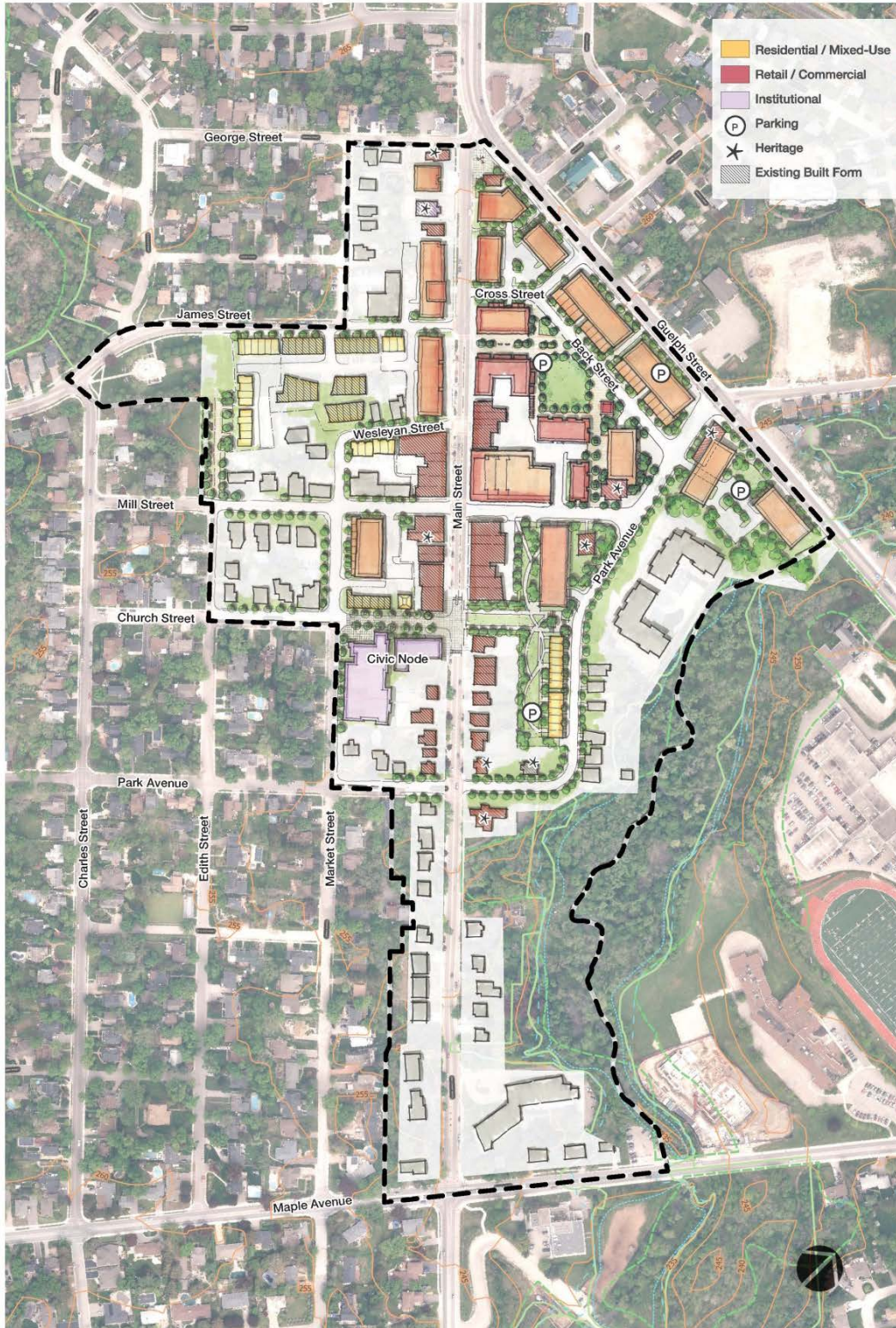
Figure 8: Revised Preliminary Preferred Alternative