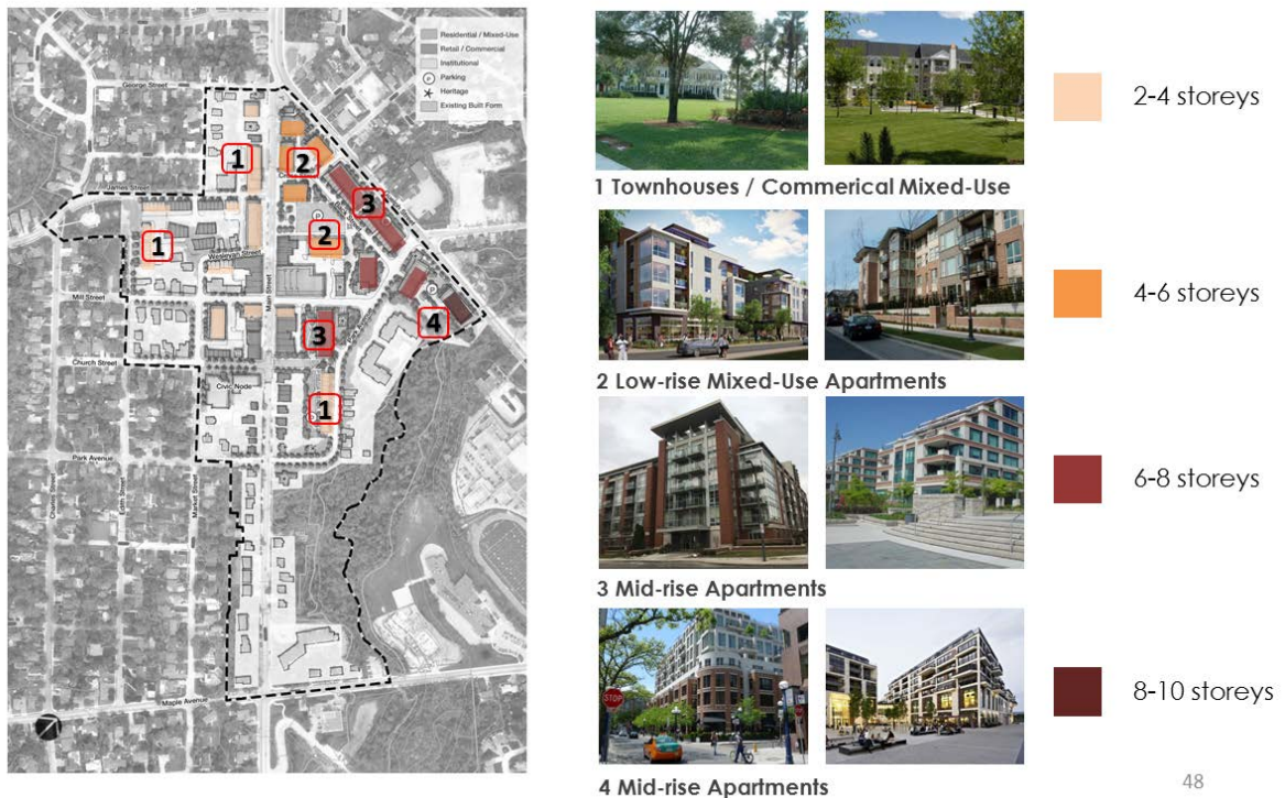
Figure 7: Preliminary Preferred Alternative – Proposed Heights