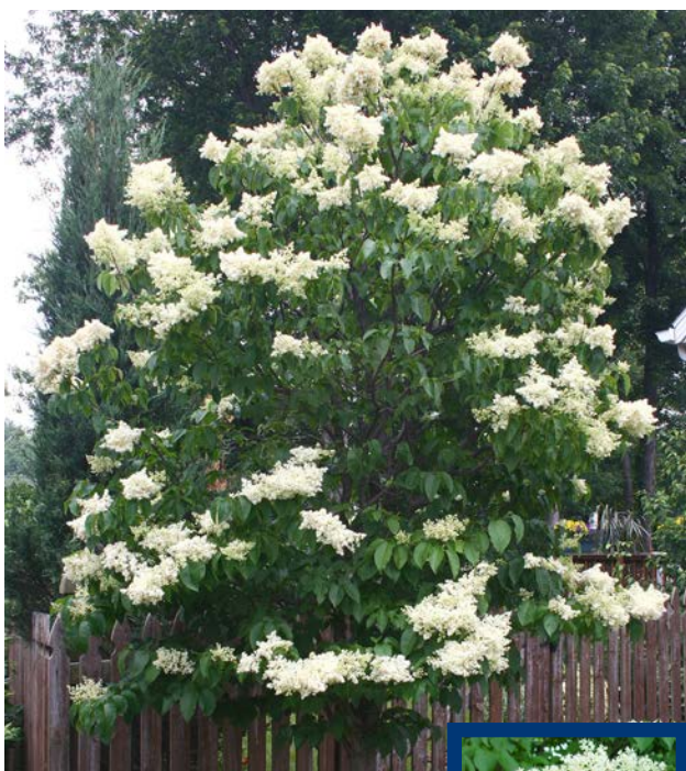
Ivory Silk Lilac Tree