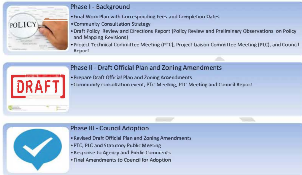
Figure 1: Three Phase Planning Process

Regional policies and initial observations of where policy and mapping amendments may be necessary to the Town of Halton Hills Official Plan and Zoning By-law.