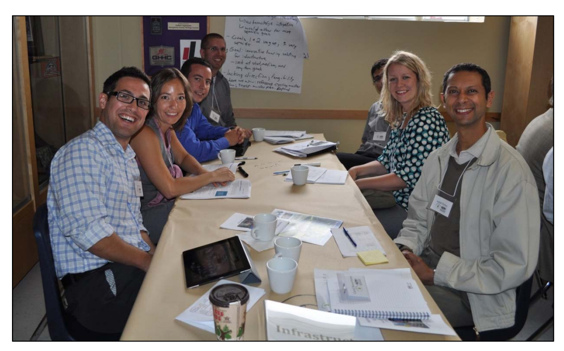
Sharing ideas at the Sustainability Forum.

A very successful Sustainability Forum was hosted in May 2012. The objective of the Forum was to familiarize the community with the Sustainability Strategy, as well as to gather valuable feedback on the emerging draft sustainability visions, focus areas and goals. Approximately 130 participants were in attendance, including residents, businesses, community and regional organizations, Town Councillors and staff, and Halton Region staff. Participants provided valuable input and direction that validated the work to date.