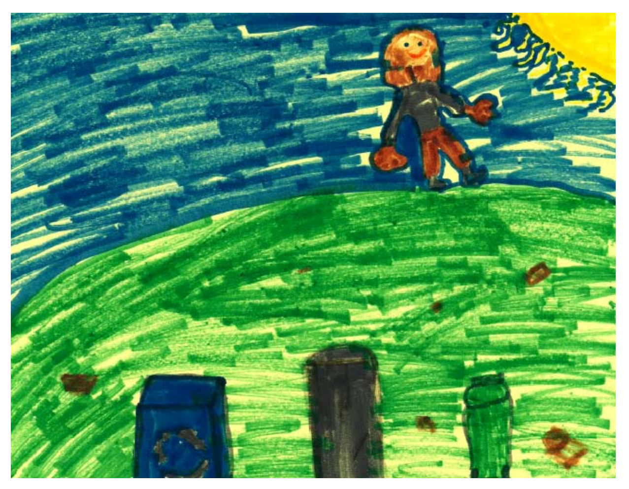
Artwork by a local Town of Halton Hills student showing what they love about their community.

By 2060, residents hope that the ample greenspace currently buffering Halton Hills from its more urban neighbours will remain, valleys, wetlands and other natural areas will be protected, Halton Hills' unique blend of urban-rural character will be maintained, neighbourhoods will be walkable and connected with trails and bike paths, new development will occur in a sustainable fashion, and existing parks will be used to their full potential.