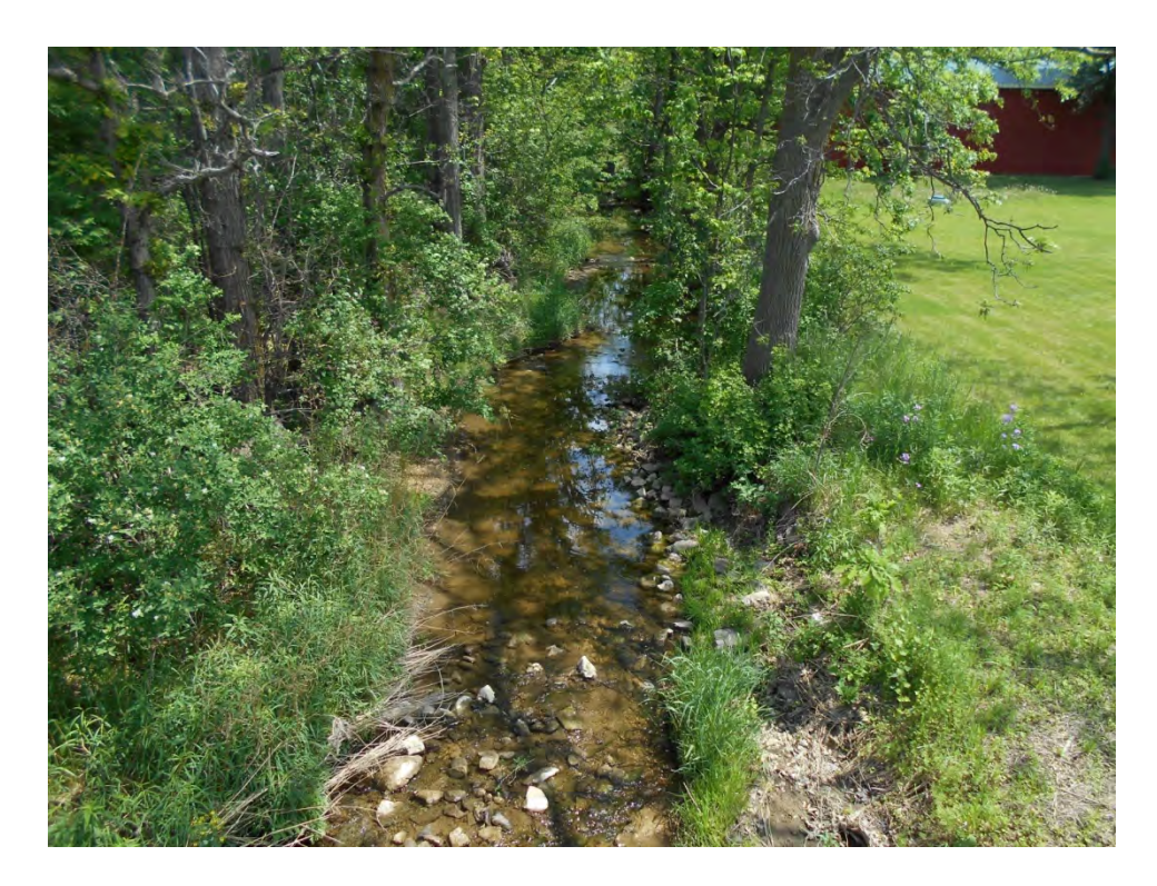
Photo 53. Looking downstream from road crossing (downstream extent).