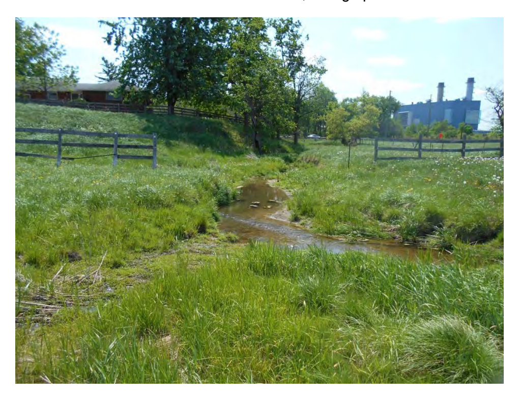
Photo 32. Downstream extent, facing downstream, Steeles-002 (left) is converging with Steeles-003 (right).