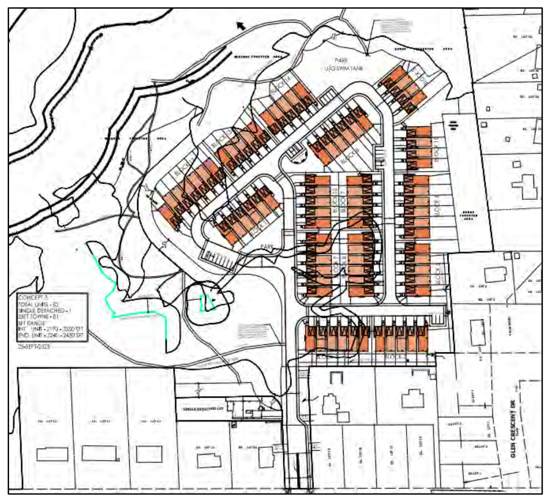
Figure 1 – Architectural Concept Plan

159 Confederation Street Town of Halton Hills