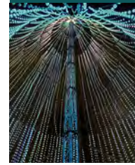
Barb Redford, Lit up to the Sky , photograph

The annual photography competition, show, and sale returns! Organized by Halton Hills photographers, this exhibition aims to raise awareness and educate the community about the art of photography.